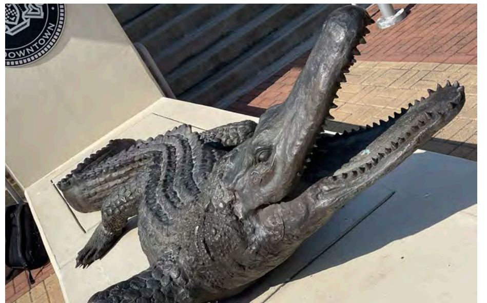
The only statue that properly depicts an alligator is the one at the southside staircase of the Shea Street Building.