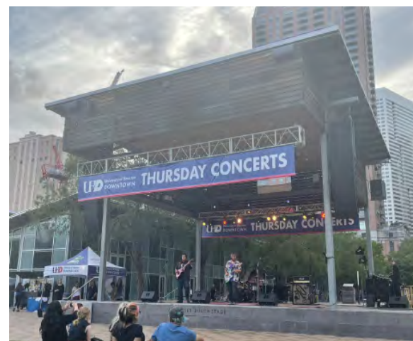
Crowd listens to the musicians perform for UHD Thursday Night Concerts at Discovery Green on April 28.