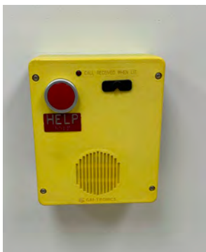
Callboxes are on all the floors of the buildings