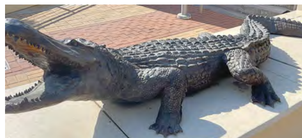
Can you spot the difference between the One Main Building METRORail entrance statue (top) and the Shea Street Building statue (bottom)?