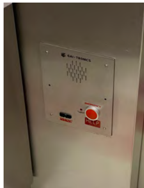
Callboxes are located inside the campus elevators.