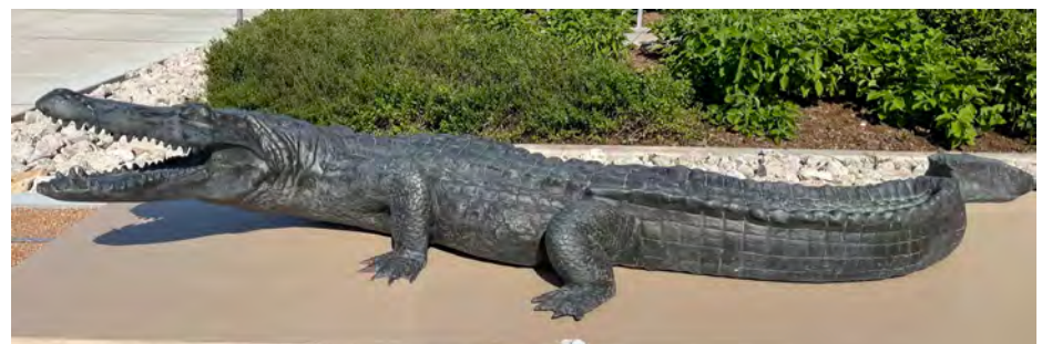
The “alligator” statue outside the northside of the Sciences and Technology Building is actually a crocodile.

The good news is that the statue outside the Shea Street Business Building is an alligator. “The head looks good, big head with no prominent snout,” Price said. “The scales are uniform across the tail, not crazy pronounced like you’d see on a crocodile.” For once, the legs were done properly. The scales on an alligator’s legs should have a uni-