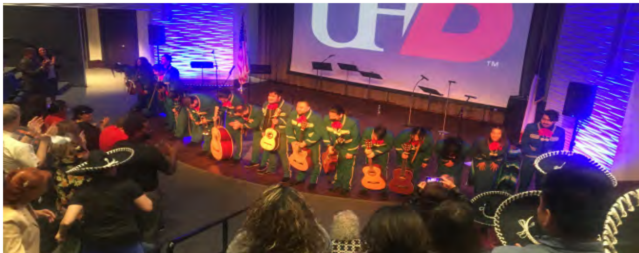
Los Caimanes perform in Wilhelmina Cullen Robertson Auditorium on May 4.