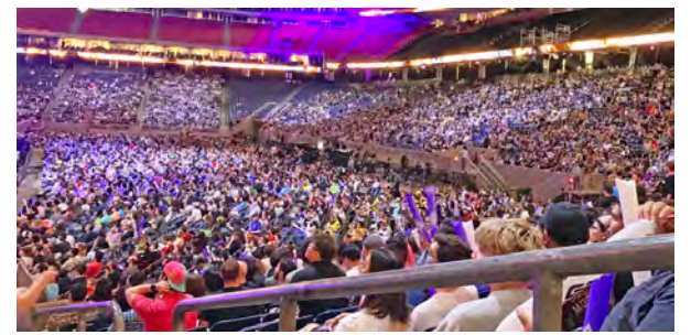
Sold out crowd at NRG Stadium watches LCS Finals on April 24.