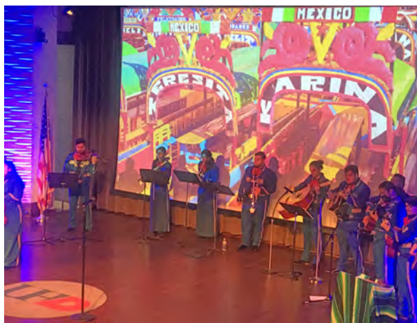
Los Caimanes’s perform “Cruz De Olvido” on May 4.