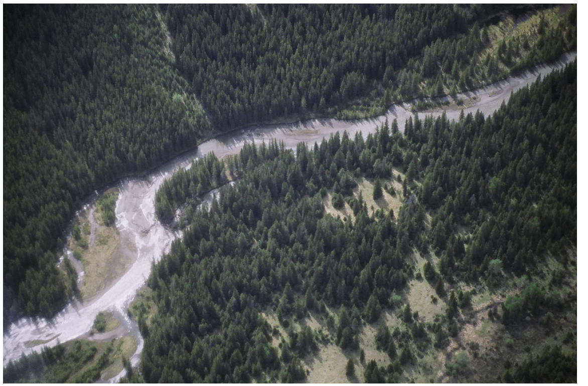
Some 500,000 acres of boreal forest in Ontario and Alberta alone - key habitat for caribou, lynx, wolves and scores of birds - are felled each year to provide pulp for toilet paper, paper towels, paper tissues and other disposable household paper products.

NRDC and other groups are pressuring the tissue products industry to change its ways, and are working to educate consumers about their options when buying tissue paper products. NRDC's online "Shopper's Guide to Home see Paper on page 9