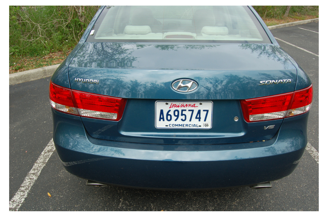
Rental car companies are offering many more hybrids and other fuel efficient vehicles in response to increased consumer demand for better mileage and lower emissions. Pictured: a Hybrid Hyundai Sonata on a Hertz lot in Louisiana.

Hertz may have sparked the trend in 2006 when it launched its Green Collection, which includes thousands of fuel efficient cars such as the Toyota Camry, Ford Fusion, Buick LaCrosse and Hyundai Sonata. These models, now available at 50 airport rental locations, average 31 miles per gallon (mpg) on the highway, and most carry the U.S. Environmental Protection Agency's (EPA's) SmartWay certification, indicating lower greenhouse gas and other emissions. In June 2007, Hertz bolstered its green offerings significantly by incorporating some 3,400 Toyota Prius hybrids into its American rental fleet.