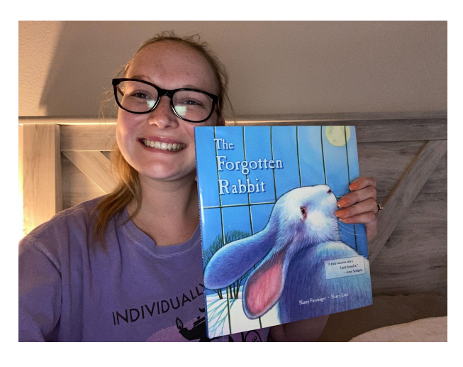
Figure 3. Graduate student with RedRover text

students enrolled in my course were able to add a RedRover Readers certification to their resumes.