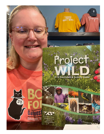
Figure 4. Graduate student with ProjectWILD Resources

to engage with each other, ProjectWILD was the only opportunity for the class to engage as a collaborative whole with the instructor. While the students were excited to have received another set of free resources that was TEKS-aligned in both science and social studies content, the training was definitely mixed with mixed reviews. Like RedRover Readers, graduate students were able to add a certification to their resumes upon completion of the Unlike RedRover Readers. training. graduate students were only able to engage with ProjectWILD as students rather than practice facilitating a lesson. For this particular endeavor, we met synchronously for a four-hour training on a Saturday. This decision was made because it was how my own certification had been structured and I wanted to keep things as simple as possible. However, multiple students, including Anonymous Student # 2 (2021), "didn't like that [she] had to take up a Saturday to complete this training for class." Despite this, one student wrote that "If I had to pick one thing [I enjoyed the most], it would be the ProjectWILD component" (Anonymous Student #1, 2021).