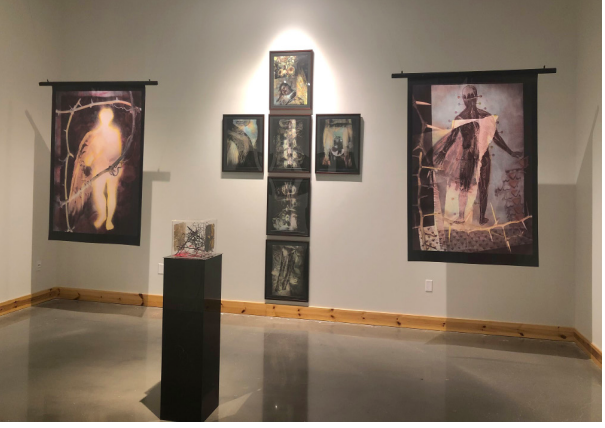
A portion of the art galley on display at O'Kane Gallery.

The event that impacted her the most was the death of her mother. To commemorate her