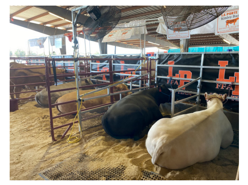
Pasadena Livestock show offers opportunity to get a close experience with cattle.

Locals are welcome to join their membership program and attend the upcoming General Membership Meeting on Nov. 14.