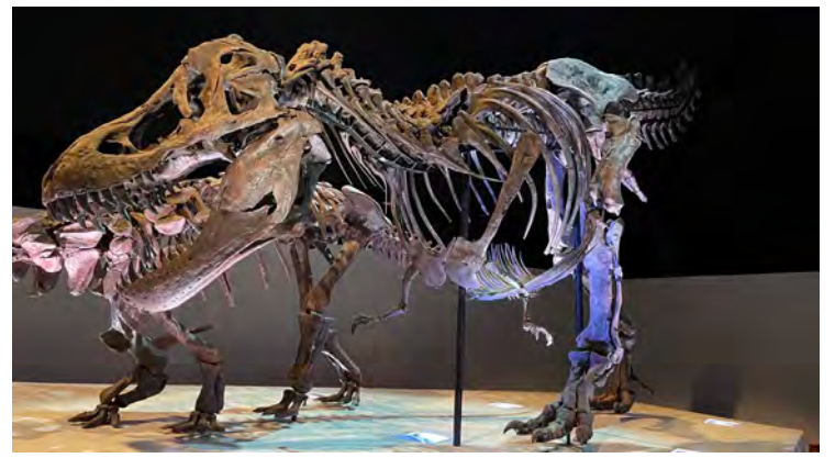
Display of T.rex at HMNS.

Despite its negative impacts on the public, the Jurassic franchise has been an overwhelming boon for paleontology. To end on a