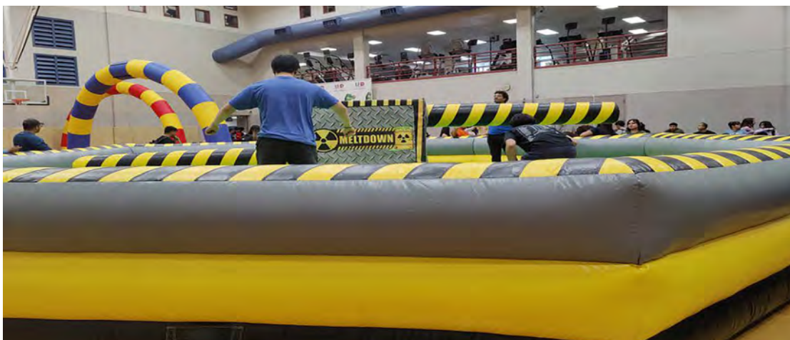
UHD Gators playing a game of Wipeout. Don't get hit!

The Trellis Foundation is a charitable organization that aids low-income and minority students in Texas achieve their postsecondary education.