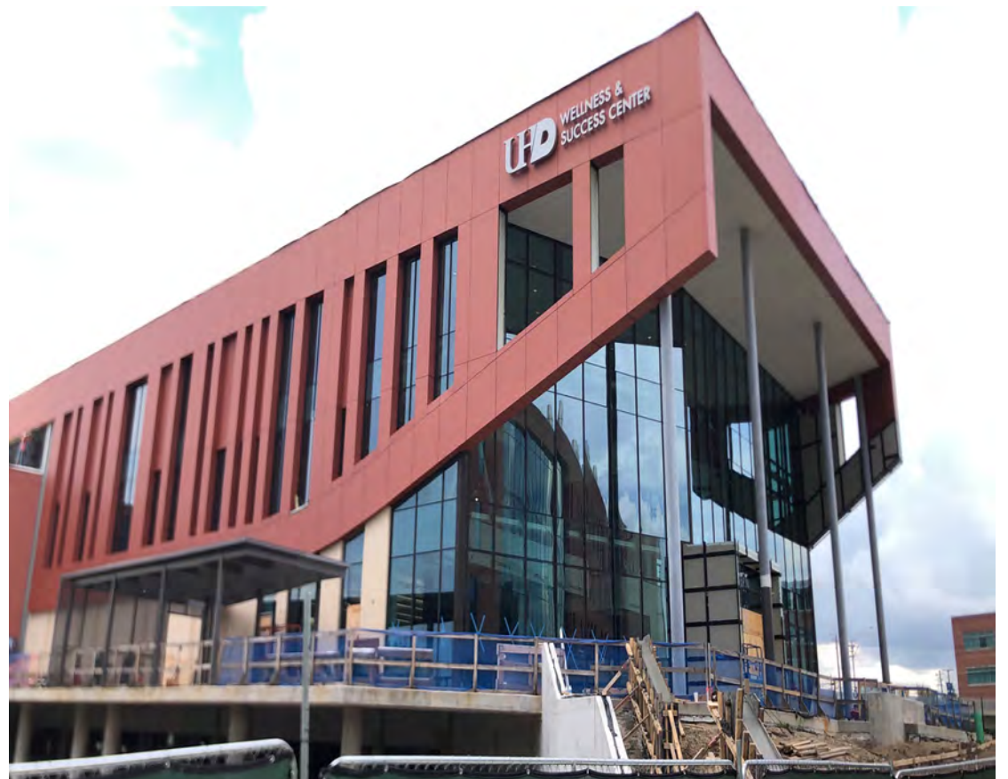
Photo of nearly completed Student Wellness & Success Center.

As a result, UHD will offer all alumni that have graduated before the center opened a free alumni membership equal to their contribution. Students that have paid that additional fee to construct the facility can enjoy the center based on however many semesters the students contributed.