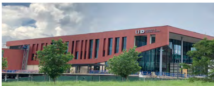
Under construction Student Wellness and Success Center is scheduled to open Jan. 2023.

He was responsible for putting up the current Student Life Center and is thrilled to bring UHD an