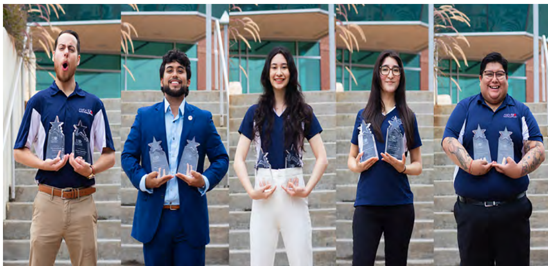
AMA Spring 2022 officers showing off their trophies.

With the pandemic causing significant ripples throughout the world, student life at UHD was a topic of