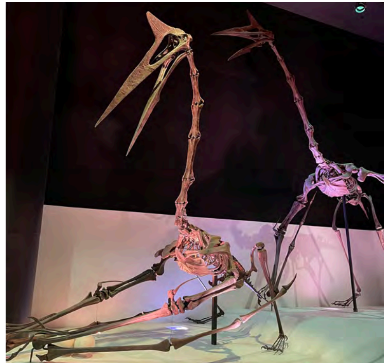
Display of Quetzalcoatlus at HMNS.