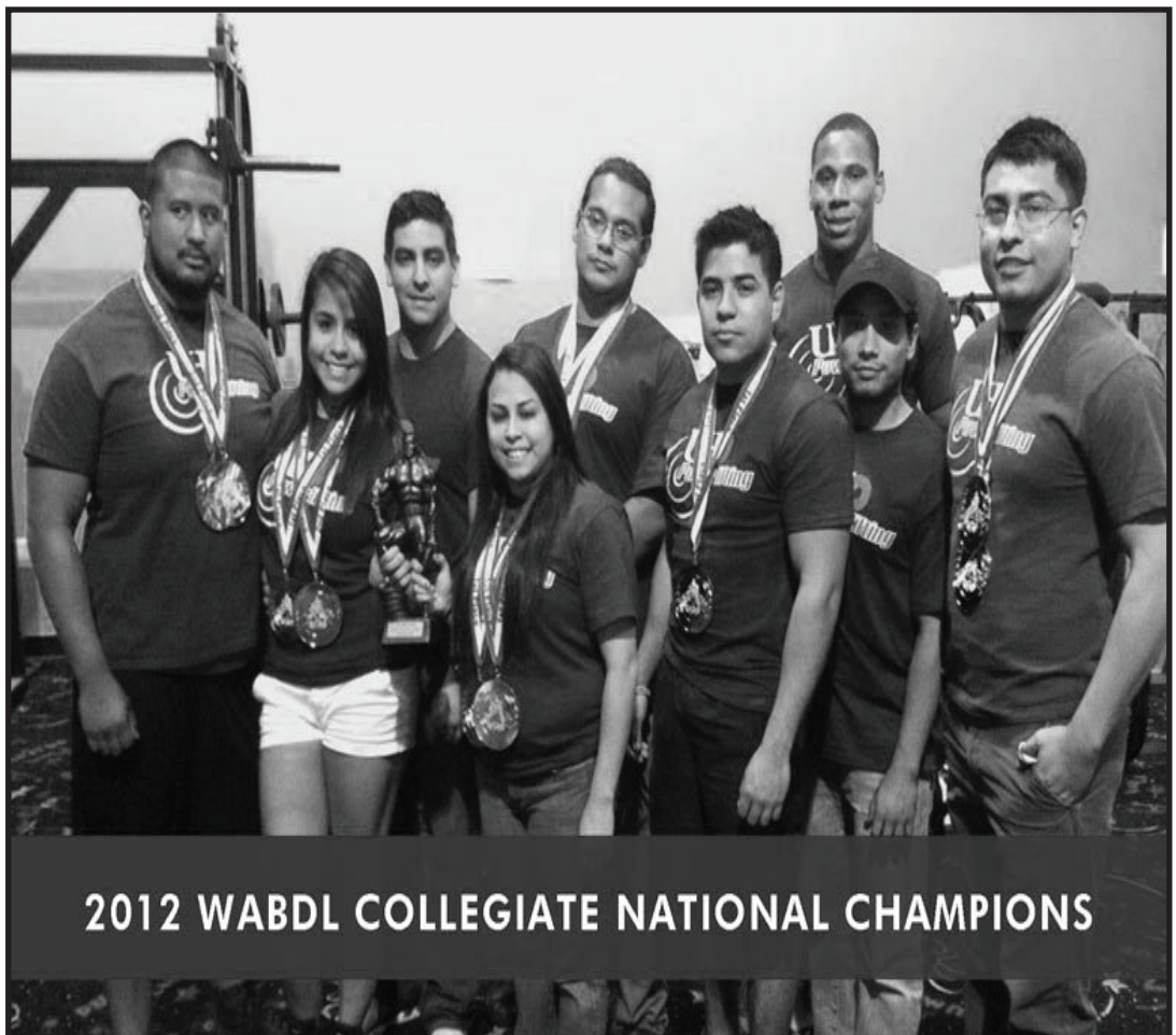
2012 WABDL COLLEGIATE NATIONAL CHAMPIONS