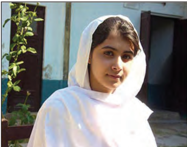
Malala Yousafzai, 14 year old Pakistani advocate rights was shot Tuesday, October 9 by the Taliban.

Malala began her crusade for girls' rights to education in response to the Taliban control of her homeland. Malala is a resident of Mingora, a Swat province of Pakistan on the