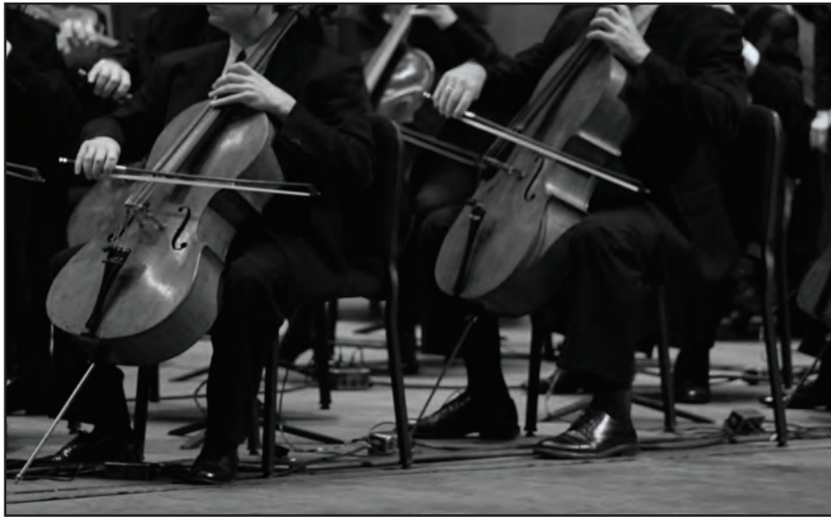
The owl-led Houston Symphony performing the music of Harry Potter