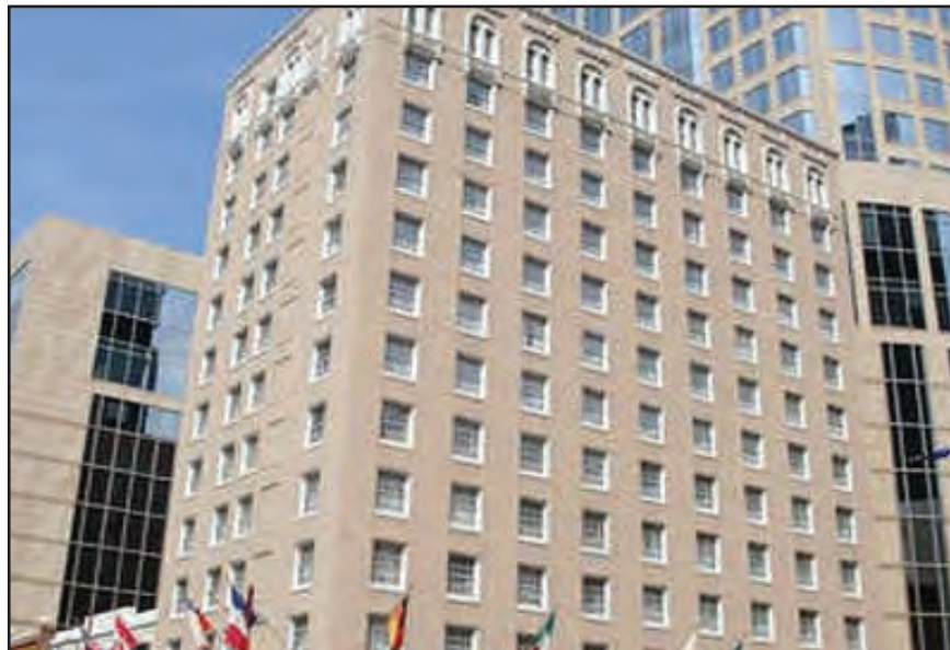
The Lancaster Hotel, known as the site for haunted experiences in downtown Houston