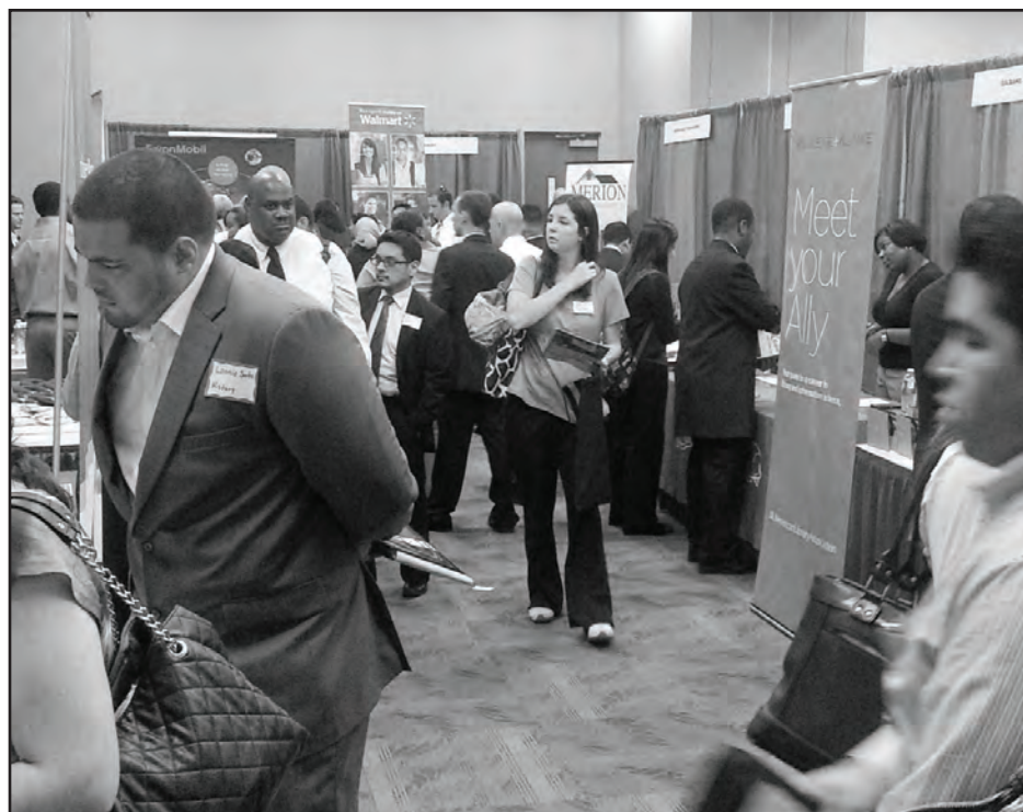
Eager students visit career fair booths hoping for a connection at UHD

Kroger, The Princeton Review, Exxon-Mobil and Stage Stores as well as some local companies were among those looking to hire on well-rounded new recruits. Exchanging resumes for business cards and informational pamphlets, students