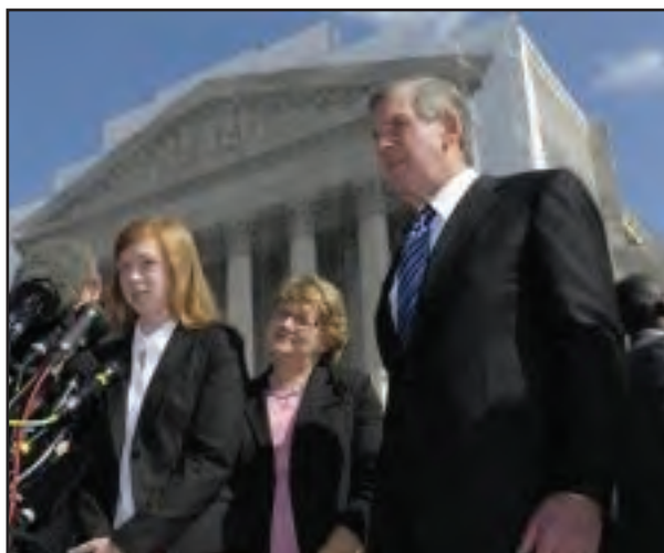
Abigail Fisher talks to reporters outside the Supreme Court Wednesday.