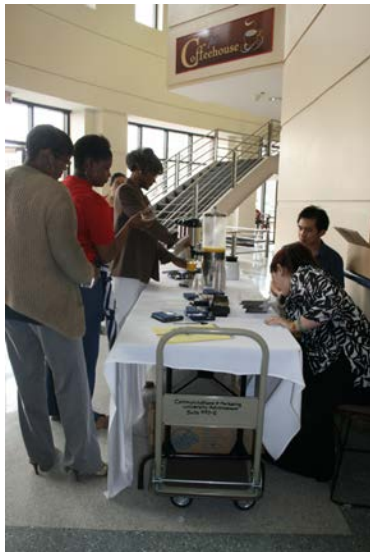
Spring Health Fair