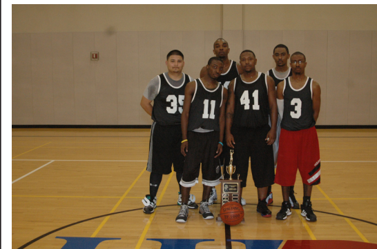
Basketball is just one of the many intramural sports that UHD's Sports and Fitness Center hosts.