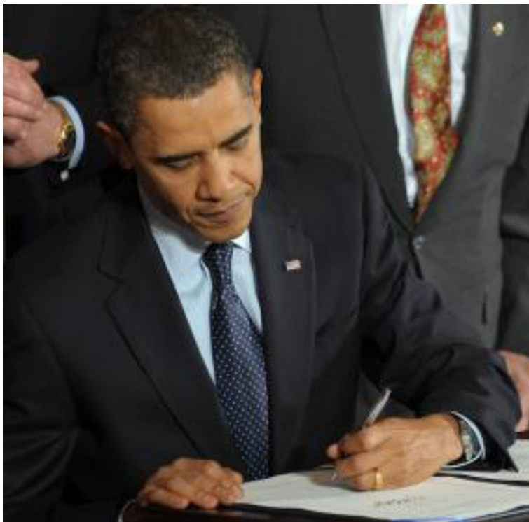
President Obama signing the Healthcare Reform Bill.