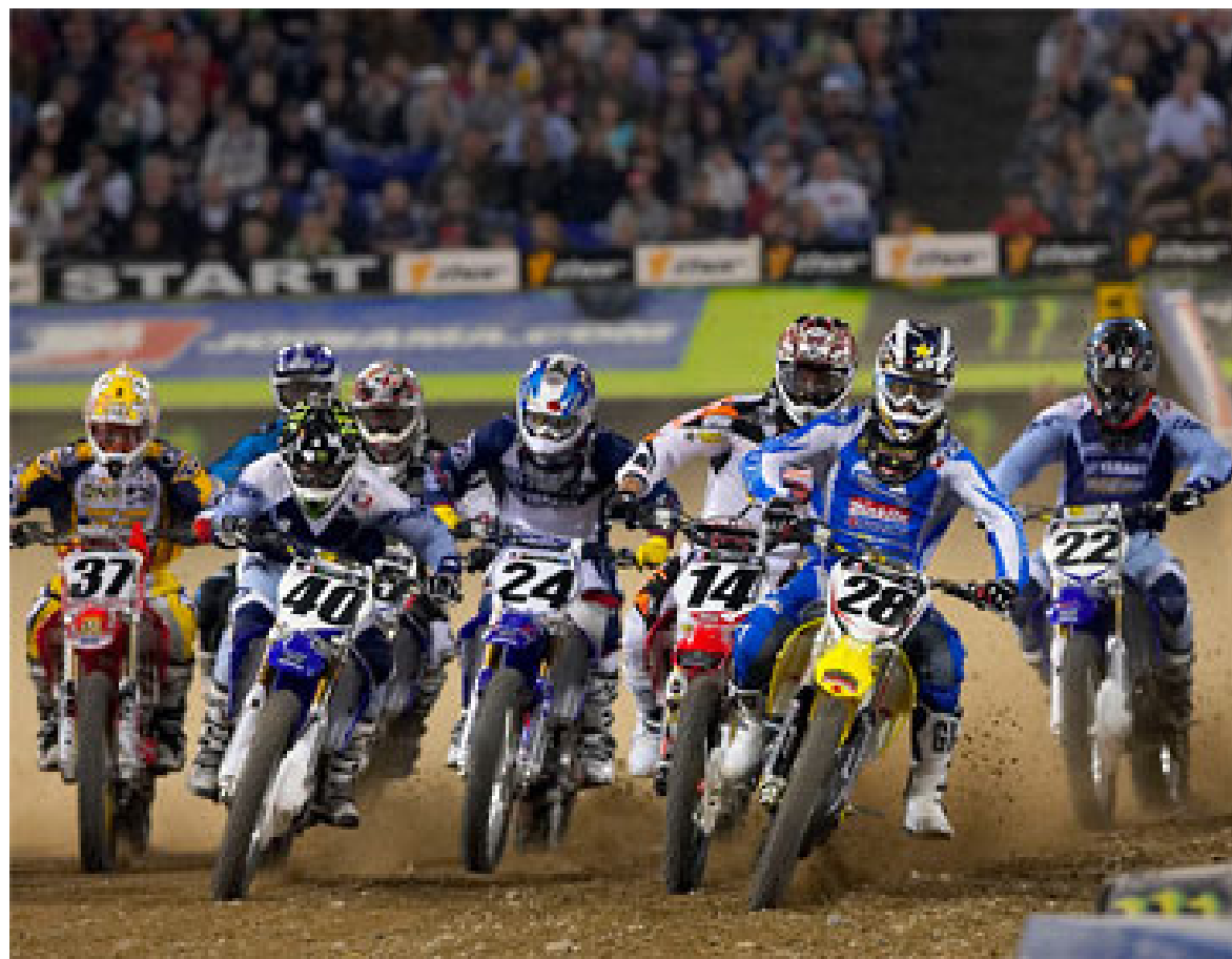
Motocross is the sport that Supercross came from. Motocross is normally held outside and is not meant for a TV audience, whereas Supercross almost exclusively take place inside sports stadiums and the target audience will be watching on TV. Because of this, Supercross racers have to be more technical in their racing courses because of the limited space inside the stadiums.

You can meet the riders and get autographs at the Pit party Saturday from 12:30–6 p.m. Free access to the Pit Party will be granted to race fans that bring a Monster Energy Can accompanied with a valid ticket. You can also purchase a pass for $10.00 at the box office if you forget your can. The supercross has "gone green" and will recycle your cans at the gate. So remember to buy your Monster Energy Drink before the event and you will save money while recycling. Field level ticket prices are $40.00 and $10.00 for kids, but they are both $5 more the day of the race. You can buy your tickets at the box office or online. Be safe, be smart, and enjoy the fastest sport on two wheels.