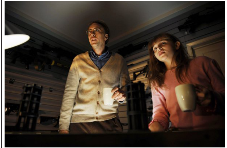
The relationship between Chloe Moretz and academy award winner Nicolas Cage is what makes “Kick-Ass” not become like a typical comic based movie.