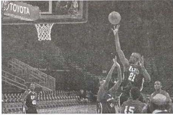
Both UHD Men's and Women's Basketball intramural teams had the opportunity to play in the Toyota Center. For more information on the basketball intramural teams and other, you can go to http://www.uhd.edu/sportsandfitness/intramuralsports/spring.html