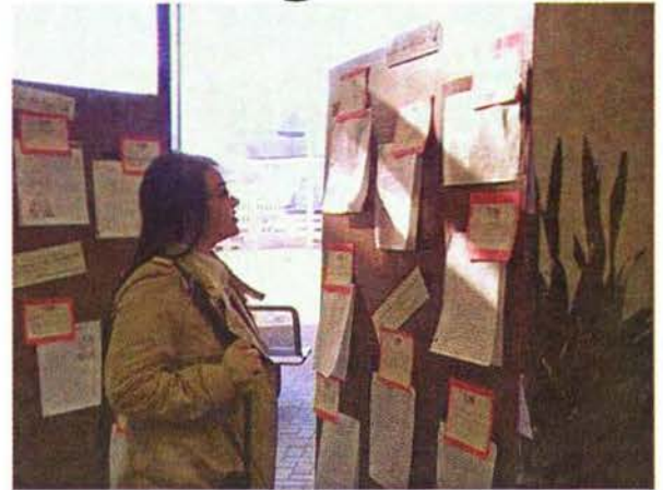
Various UHD students stopped and read the pieces written by various HISD students in the North Region.