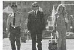
MacGruber

For the entire list of films at this year's SXSW Film Festival check out SXSW.com .