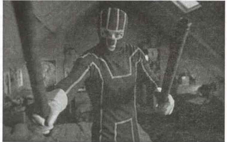
Dave Lizewski (Aaron Johnson) is a comic-book fanboy who decides to take his obsession as inspiration to become a real-life superhero. This twisted, funny, high-octane adventure, based on the comic written by Mark Millar and John S. Romita, Jr. will be opening the SXSW 2010 Film Festival.

Film festivals are no stranger to Houston. Houston's own Cinema Arts Festival brought headlining films to the city. According to the festival's web site, "The list of high-profile guests was short but selective. It's a shame that Tommy Lee Jones dropped out, but with