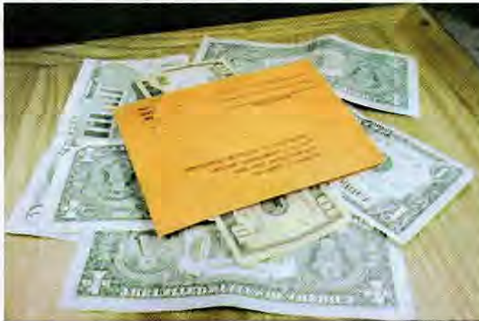
An orange envelope will be placed under your windshield if you have parked incorrectly. You can challenge parking tickets if a mistake has been made. You would have to go to the Parking and Transportation Services Office. Note, the parking tickets are issued by UHD Police.

It was not because I was taking up two parking spaces, parking directly in a no parking zone, or just creating a parking spot; but because I was a little too far over the line. My car was not deliberately parked in the middle of the no parking zone; I just on the edge of it. After I paid my ticket and went to the UHD Parking and Transportation Services Office, I was informed that there have been other students that have complained about tickets