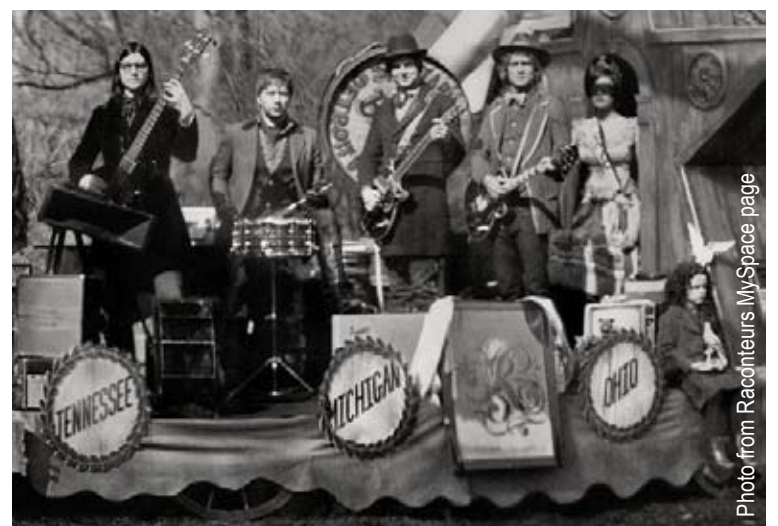
The new album cover for Raconteur's "Consolers of the Lonely". Band members from left to right: Jack Lawrence on bass, Patrick Keeler on drums, Jack White on guitar, and Brandon Benson on guitar.

So whether you get your kicks laying on your leather jacket and reading Nietzsche on the quad or if you're all about the upcoming sorority party, you'll still be slightly cooler after listening to this album. ■