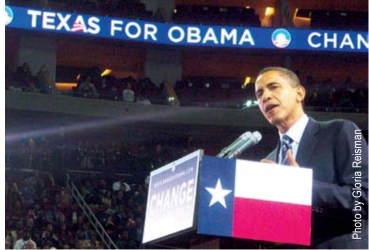
Obama speaks to a crowd of 19,000 at the Toyota Center

The Obama campaign has been booking large sports venues across the country –and filling them up. The announcement that Barack Obama was coming to Houston had been known for