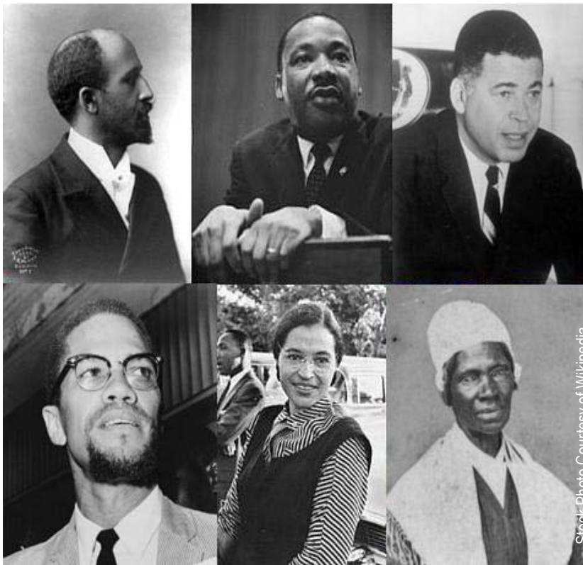
Clockwise from Top Left: W.E.B. Du Bois; Martin Luther King, Jr.; Edward Brooke; Sojourner Truth; Rosa Parks; and Malcolm X