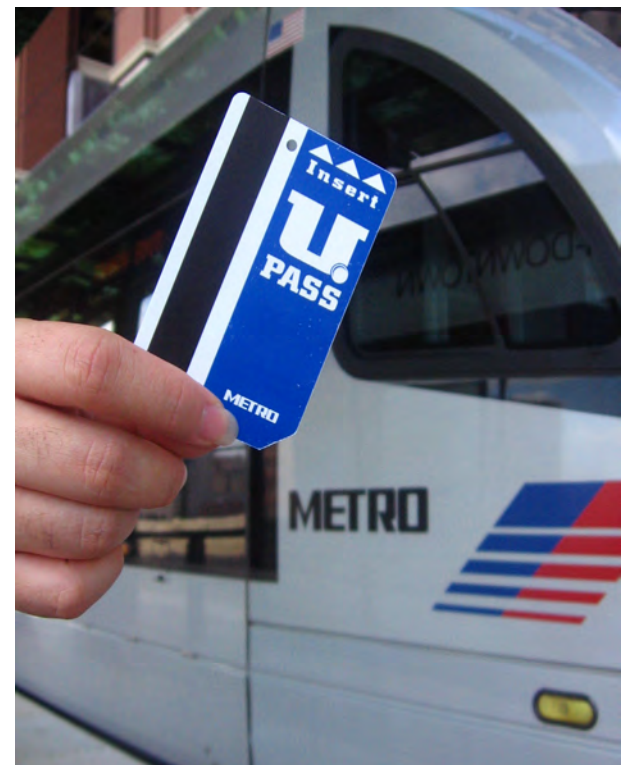
Will U be commuting by car come next semester?