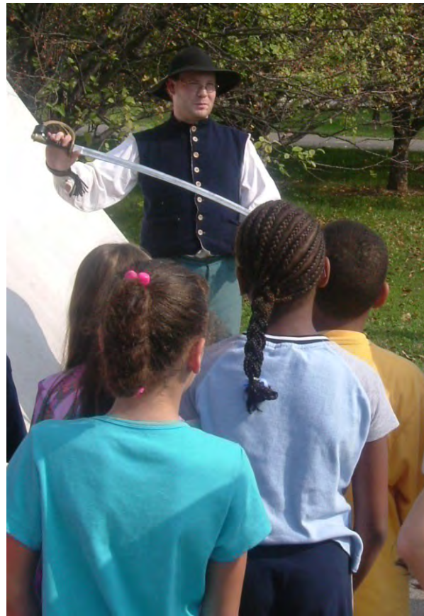
Torture revisited for young children through slavery exercises

Despite recent gains, she knew that the legacy of slavery was still with us. She also knew