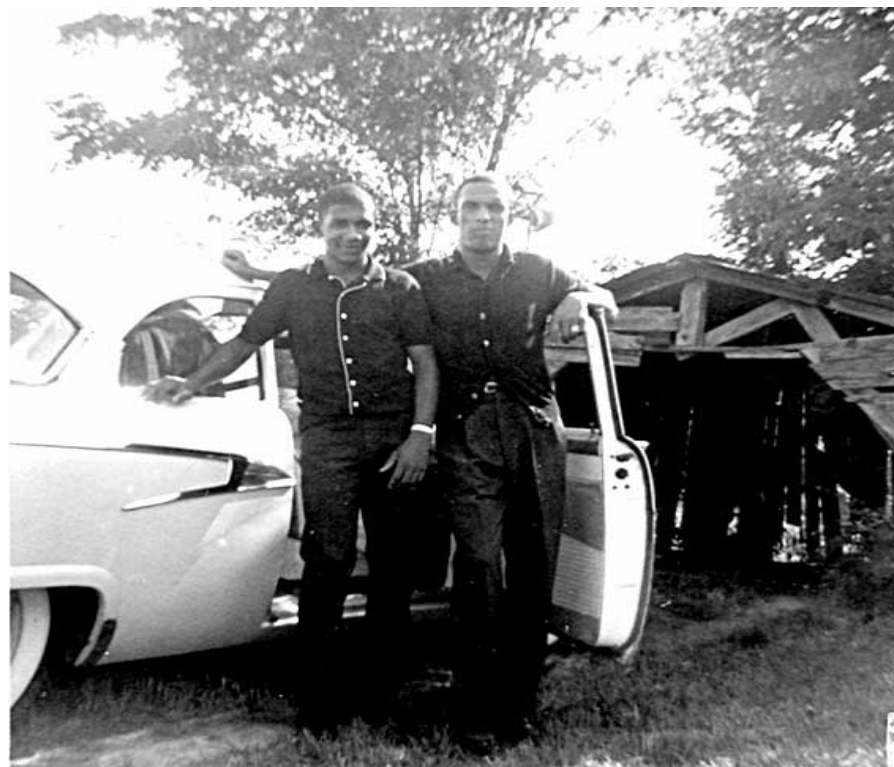
By Mike Faulk The Crimson White (U. Alabama) (U-WIRE)

TUSCALOOSA, Ala. - They were two black teenagers walking a rural road in Franklin County, Miss., only hoping to hitch a ride. Some white men pulled over for them but took them anywhere but home.